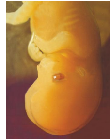
7 weeks after fertilisation