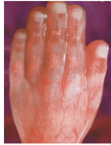
...and then at 11 weeks