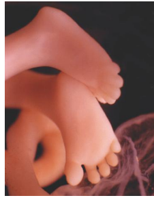
At 11 weeks he can respond to touch